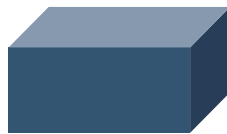
Double thin format (2DF) 240 x 115 x 113 mm