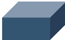
Triple thin format (3DF) 240 x 175 x 113 mm